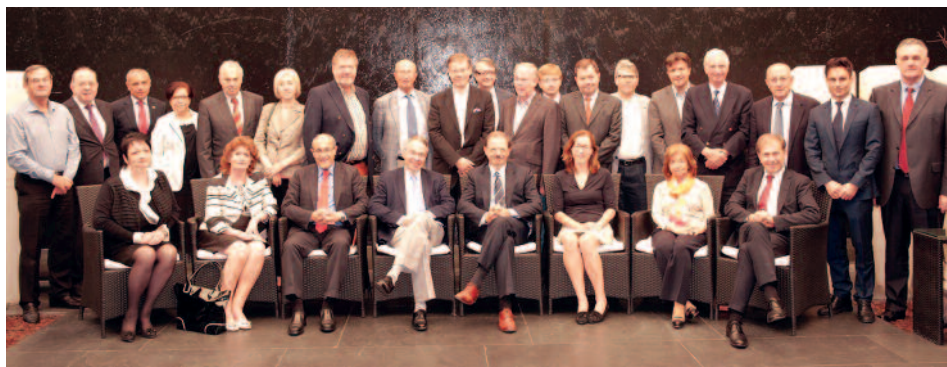
Board and Honorary members attending the SE2014 Board meeting in Lisbon, Portugal.